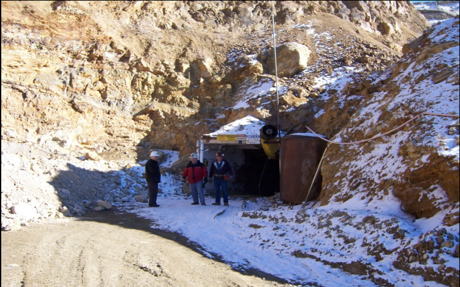
Mine Access Decline (Adit) looking East