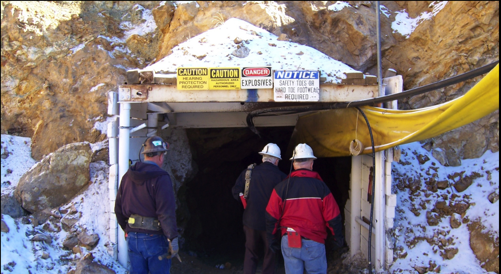
Mine Access Decline (Adit) looking East