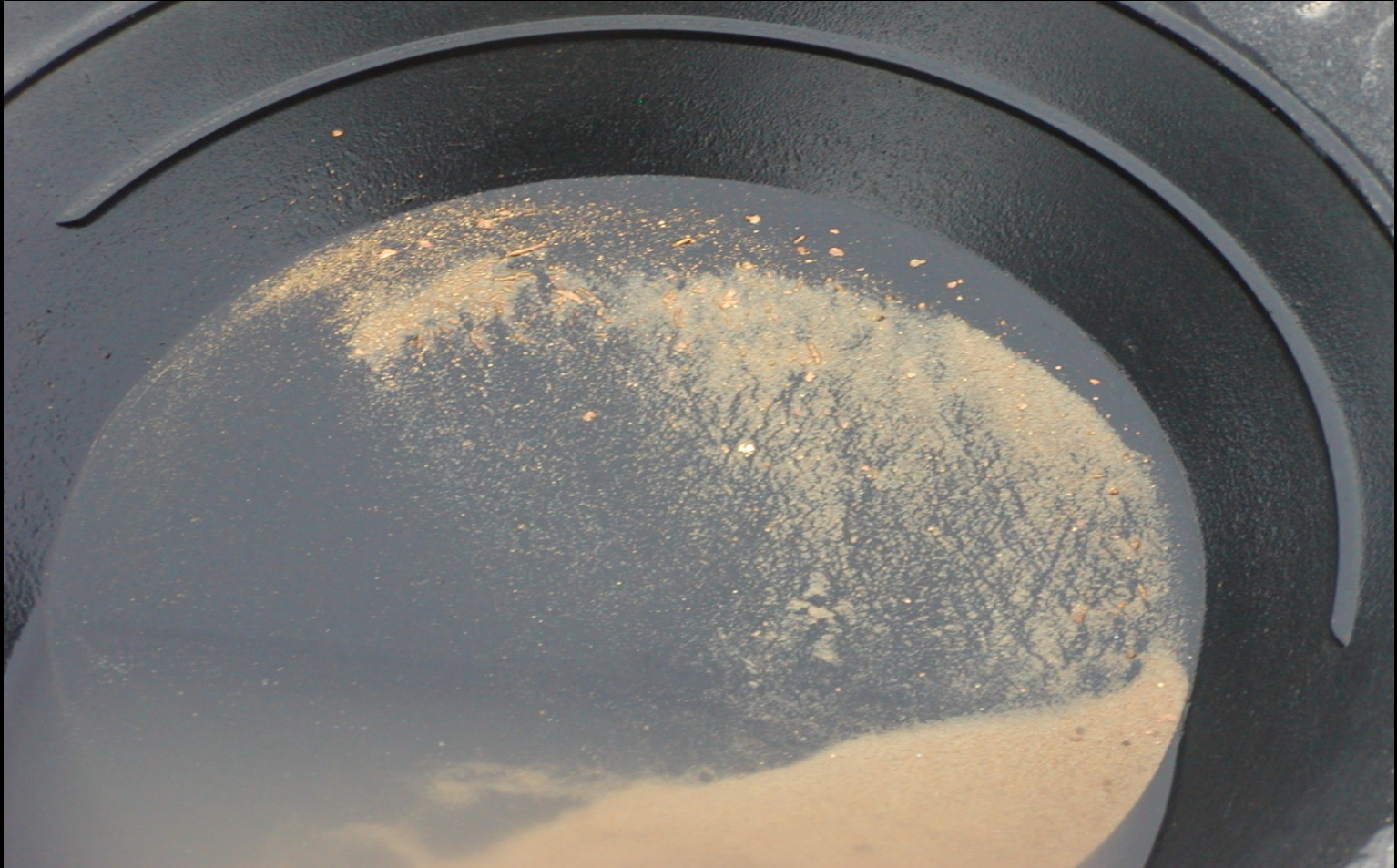
Gold particles collected in pan