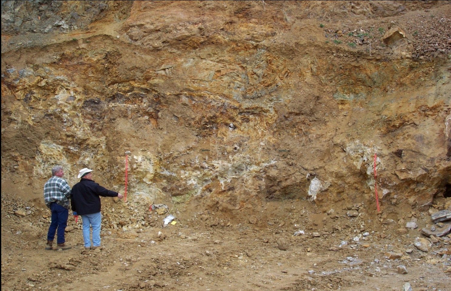
Gold Zone looking North East