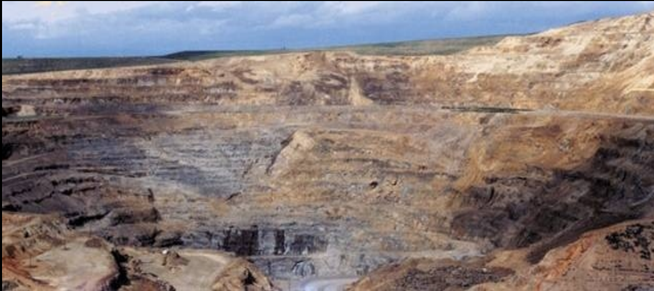
GOLDEN SUNLIGHT PIT

The Golden Sunlight deposit has been mined by conventional open-pit methods and has produced 2.5 – 3 million ounces of gold to date.